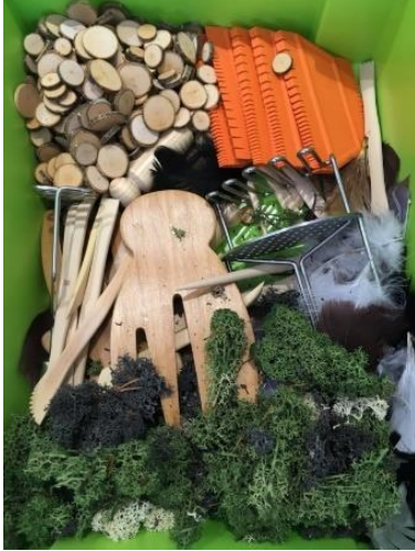
Materials for Cut it Out

Kids; Cut it Out! 2019 was inspired by the Cut and Paste: 400 years of collage and Anya Gallaccio in the NOW 5 exhibition at the Gallery of Modern Art with a programme of daily activities help out in the grounds. Families were invited to think about colourful collage, dropping into different stations, playing with paint on different scales and playing with clay collage and natural materials - incorporating outdoor activities, art creation and nature.