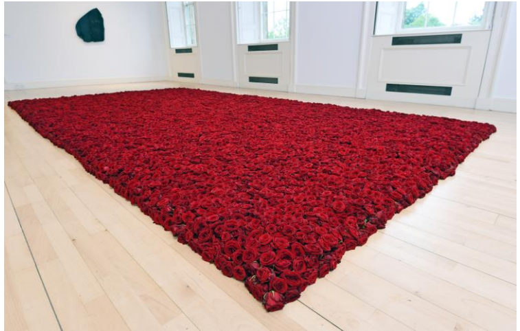
'Red on Green' by Anya Gallaccio, 1992-present'. Collection - The Hyman Collection, London & the artist © Anya Gallaccio. Photo by Neil Hanna (2)

“The Paisley-born artist, who was nominated for the Turner Prize in 2003 and was a prominent figure in the Young British Artists generation, is renowned for her spectacular installations and sculptures. Using all kinds of organic materials, including trees, flowers, candles, sand and ice, she creates temporary works that change over time as they are subjected to natural processes of transformation and decay. Gallaccio also makes more permanent artworks in bronze, ceramics, stainless steel and stone that attempt to capture or arrest these processes.”