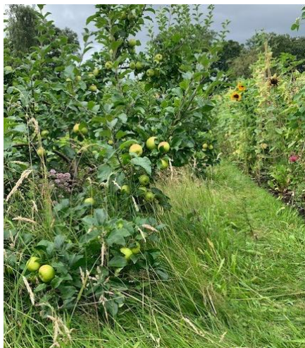
Heritage Kitchen Garden orchard

In 2008 bird boxes were installed at the Gallery of Modern Art. In 2017 more bird boxes were added on site to create safe nesting spots for local wildlife. 16 bird boxes and 6 bat boxes were installed at strategic spots around the grounds to help support the biodiversity in the area. There are plans to install more houses in 2021.