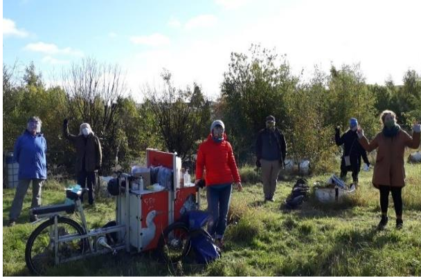
Pruning Workshop with local gardeners

A final site visit was made by the National Museum of Scotland colleagues involved in the Natural History Curation Collection Team, from invertebrates, and vertebrates. Discussions are currently underway for organising ID workshops and sustainability workshops across both organisations with a local primary school. Long terms plans are being made for the site to surveyed and monitored with the help of the National Museum of Scotland team.