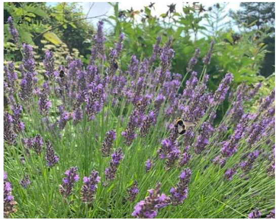
Lavender and bees at GMA site

Two beehives have been installed in the grounds by Victor Contini who owns The Scottish Cafe based at the National Gallery site. The hives, situated near the Kitchen Garden, are maintained by Margaret Forrest who is part of the Scottish Beekeeping Society. A wild garden has been planted around them to encourage honey production from the bees, in particular lavender and angelica have been planted in the surrounding area