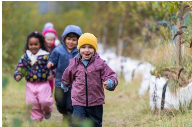
Waterfront nursery exploring the Mobile Orchard