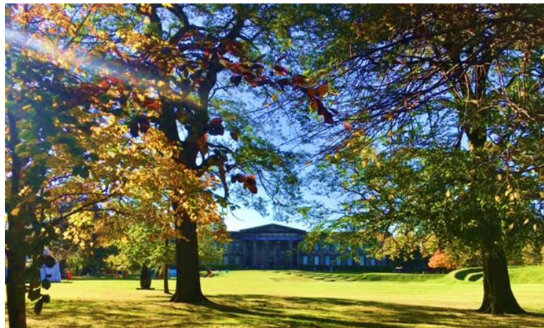
Scottish National Gallery of Modern Art One

The National Galleries of Scotland cares for, develops, researches, and displays the national collection of Scottish and international art. With a lively and innovative programme of activities, exhibitions, education, and publications, it aims to engage, inform, and inspire the broadest possible public. The estate is primarily historic buildings based in Edinburgh comprising of the Scottish National Gallery, the Scottish Portrait Gallery, and the Scottish National Gallery of Modern Art.