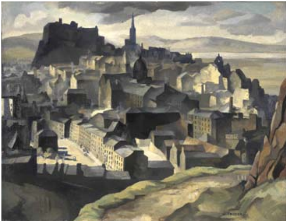
Scottish National Gallery of Modern Art