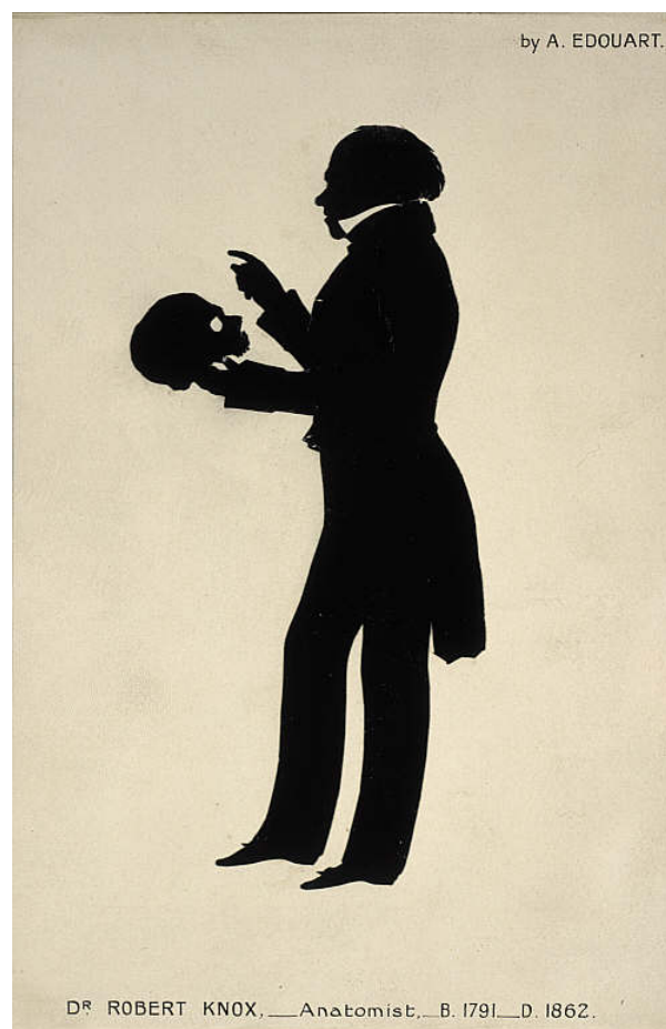
Scottish National Portrait Gallery

This French artist travelled around cutting silhouettes of many famous men and women. He worked in Scotland for two years. The works are cut from black paper, mostly of the whole figure and they are around 18 centimetres high.