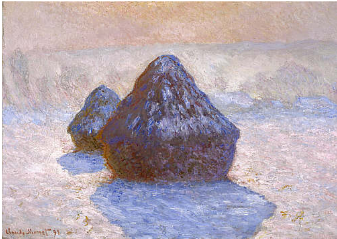
National Gallery of Scotland

He is not so interested in the haystacks but more in how light affects them.