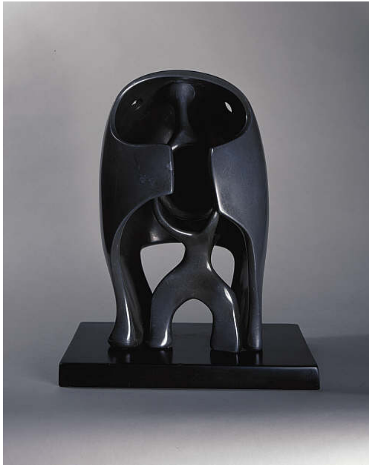
Scottish National Gallery of Modern Art

Henry Moore made many studies and sculptures of mother-and-child where the mother uses her arms in a protective way. This also relates to his drawings of shells with their simple exterior but complex interior. This piece was made in the early months of the Second World War.