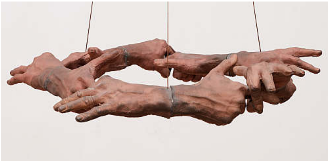
Scottish National Gallery of Modern Art © ARS, NY and DACS, London 2004

Born in America, Nauman at one time made wax casts of his body. He works in many different ways using film, photography, installation and performance.